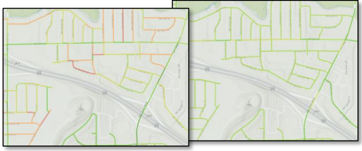
Figure 2. Maps of current (L) and projected (R) pavement condition.

Treatment strategies were identified for all 1,600 lane miles, including a timeline of when treatments should occur. The analysis estimated less than 5% of roads would be at the end of their service life in 15 years. Understanding what treatment would