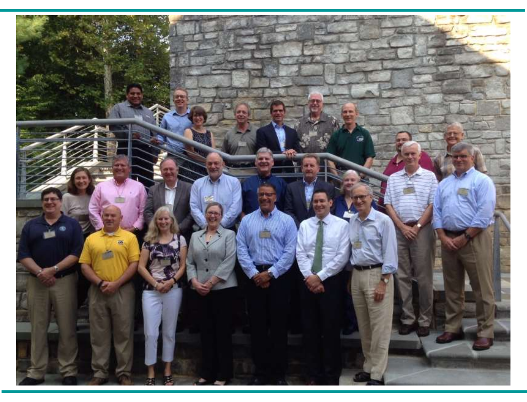
National Geospatial Advisory Committee